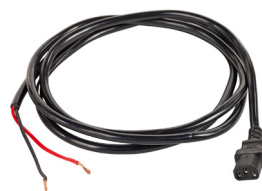
8ft electrical wire cut end included