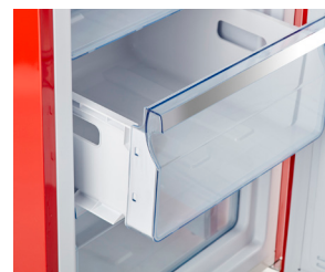
Multiple storage drawers for easy access