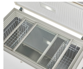
Lid and dual glass sliders, 2 wire baskets